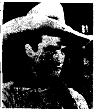
TOM MIX Hollywood Cowboy Haro

"The amusing transcribed adventures of America's favorite young couple" continued on network radio until 1954 when they moved on to an even greater fame on TV. Prior to this we had a good look at the family when Universal filmed "HERE COME THE NELSONS" in 1950. It was a funny movie and still gets some play on late night TV.